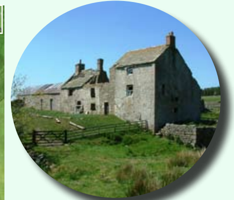
Ruined bastle and farm buildings at Moorhouses